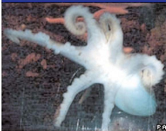
Fig. 3: Octopus from the Irish Sea near Sellafield with only 6 legs, a rare mutation making it a "hexapus." "Henry" now lives at the Blackpool Sea Life Center in a new exhibit called "Suckers". Source: BBC, March 6, 2008. 5