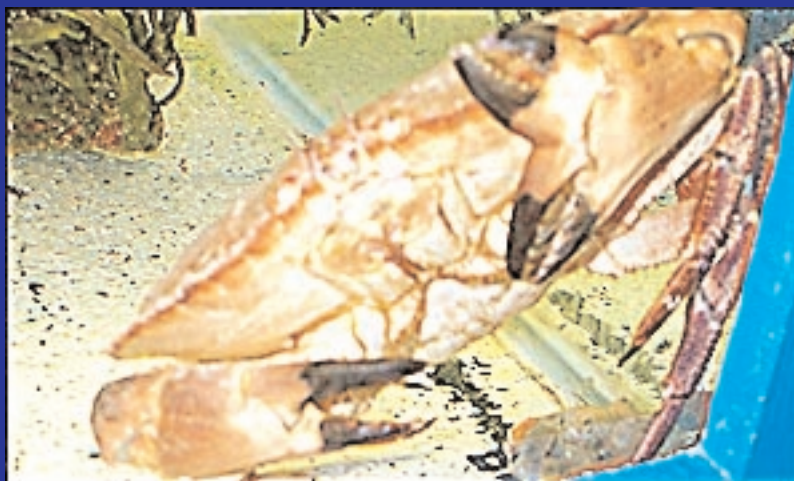
Fig. 4: A crab named "Clarissa" at the Anglesey Sea Zoo, with a mutation expressed as two claws on one leg, found in a crab pot in the Irish Sea near Sellafield. 6

Sea animals in the Irish Sea are contaminated with radiation from Sellafield, with levels of Technetium 99 reported in some lobsters to be 40 times higher than the EU Food Intervention Level. 7 The genetic effects have been reported by fishermen, who find sea life with mutations in their traps [Fig. 3-4].