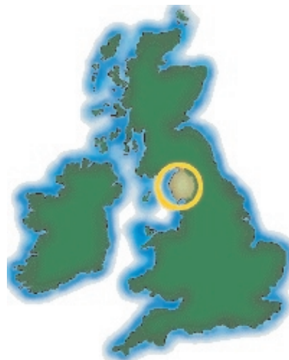
Fig.2: Location of Cumbria, the district in Britain where the Sellafield Nuclear Reprocessing Plant is located.

“Sellafield, the British Nuclear Fuels-owned reprocessing facility in Cumbria, is responsible for Tc-99 [Technetium-99] found in lobsters, seaweed and cod off the coast. Tc-99 from the facility has been washed as far as Norway, which has one of the largest salmon industries in the world.” 4